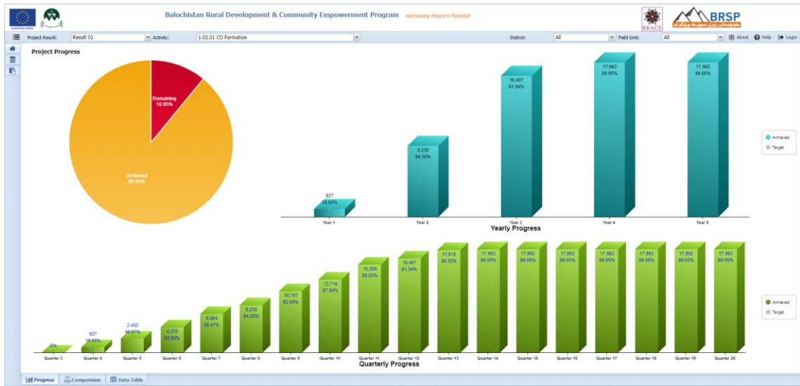
Figure 1: Community Organization Formation Progress

Home page show the overall progress, quarterly progress as well as yearly progress of selected activity either at project level, district level or at field unit level. It has Result-wise filter to select activity in any result. Home section has three sub menus i.e. comparison for selected activity with other geographic areas and overall/yearly/quarterly progress against work plan.